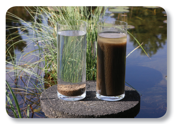
SVI5 comparison of aerobic granular sludge (left) and conventional activated sludge (right)