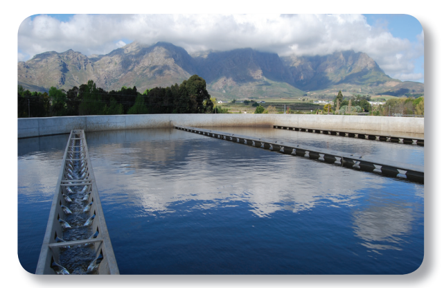
Treated effluent produced from an AquaNereda® reactor.